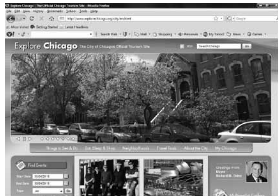
The city's official tourism website, www.ExploreChicago.org , is scheduled to roll out May 24.

“DISCOVERING CHICAGO'S Neighborhood Treasures This Summer” will be the topic of this month's WWCA general meeting on May 18 at 7:30 p.m. at the Latvian Community Center. We are delighted to have a representative from the Chicago Office of Tourism tell us about the newly redesigned and enhanced neighborhood content on the city's official tourism website, www.ExploreChicago.org , which is scheduled to roll out May 24.