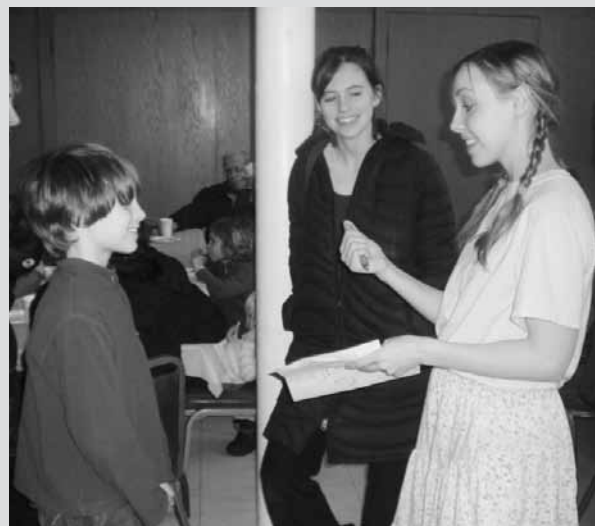
"Charlotte's Web, The Musical" actors meet with audience members after a February 20 performance at the Irving Park Lutheran Church. The free show was presented by The Irving Park Fine Arts Committee and performed by American Eagle Productions, a Chicago-based theatre group specializing in children's classics.