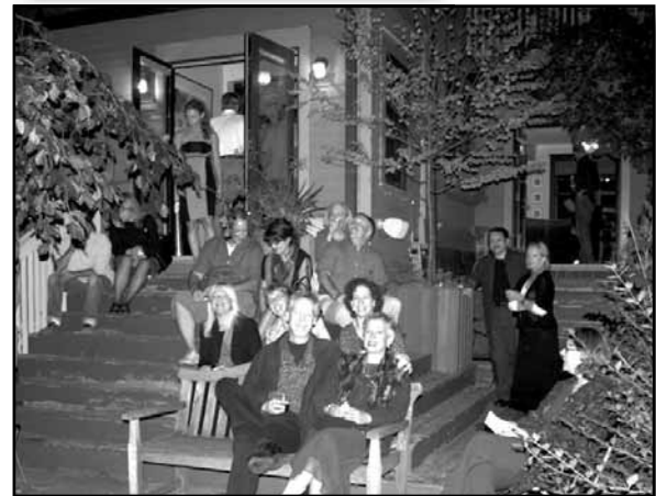
Below: Nearly 30 gather to raise funds for AIMBY