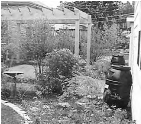
Some of Chicago's Green Bungalows utilize rain barrels in yard and garden areas.

The first step to managing stormwater at home is disconnecting your downspout from the sewer system, if conditions are right. The goal is to reduce the amount and speed of stormwater leaving your property.