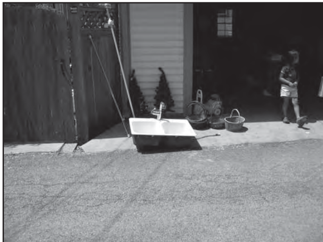
The WWCA Garage Sale had everything INCLUDING the kitchen sink!