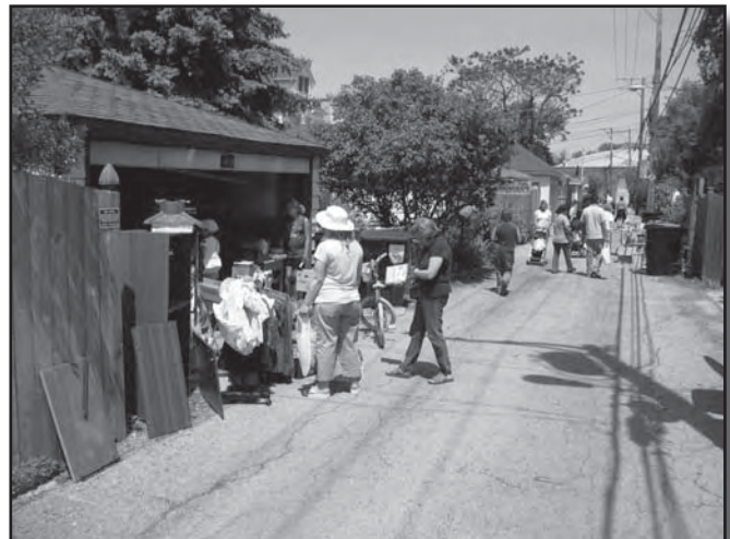
Shoppers hunt for bargains in a West Walker alley.